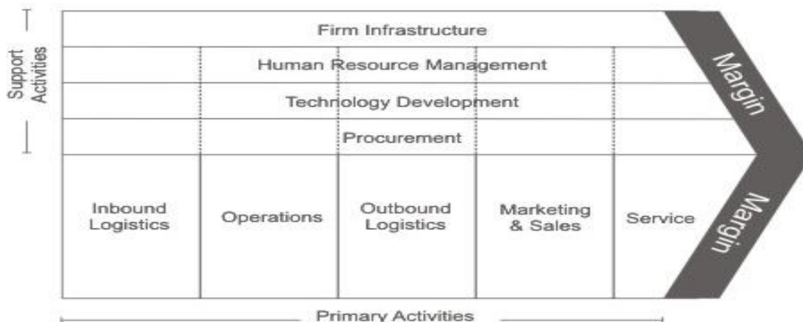
Figure 1. Porter's Value Chain