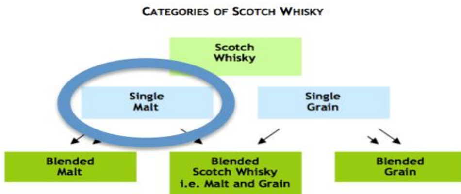
Figure 2 Categories of Scotch whisky

This research is limited to solely Scotch malt whisky (figure 2), which is defined by the Scotch Whisky Association (2009) as a Scotch whisky made from exclusively malted barley, must be distilled using pot stills at a single distillery and must be aged for at least three years in oak casks of a capacity not exceeding 700 litres. The amount of new malt whisky spirit produced at Scottish distilleries increased from 99,5 million Litres Pure Alcohol (LPA) in 1984, to 277,7 million LPA in 2015.