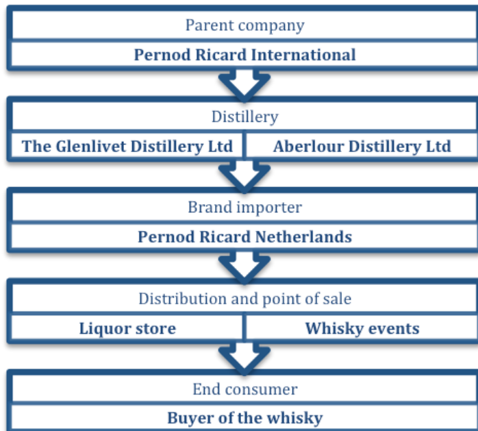
Figure 3 Whisky value chain

In order to understand which companies are involved in the whisky value chain, figure 3 depicts an example to the value chain of the whiskies of Pernod Ricard.