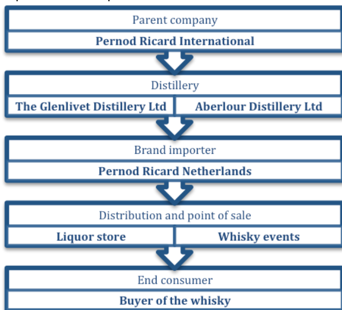
Figure 3 Whisky value chain

In order to understand which companies are involved in the whisky value chain, figure 3 depicts an example to the value chain of the whiskies of Pernod Ricard.